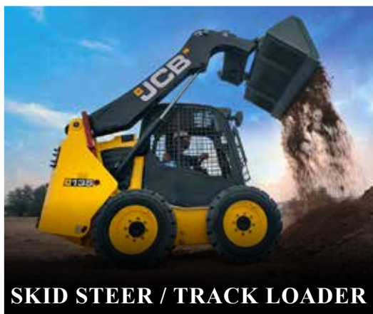
SKID STEER / TRACK LOADER