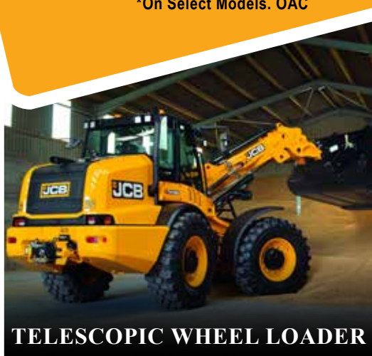
TELESCOPIC WHEEL LOADER